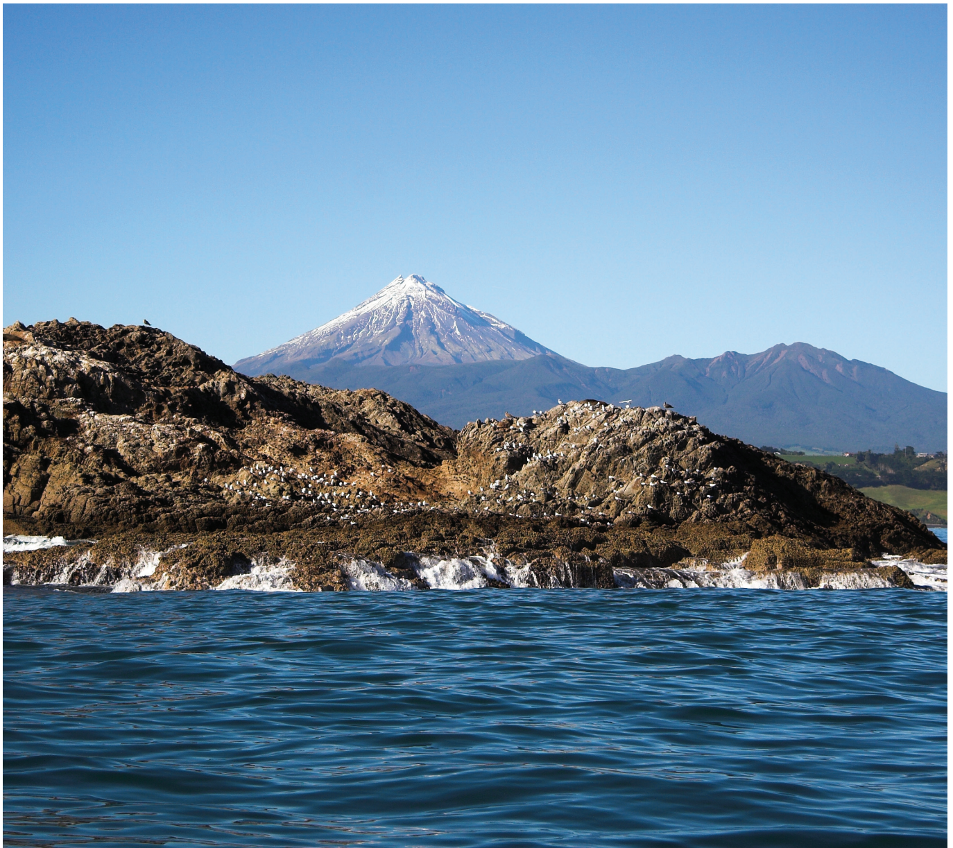
Waikaranga (Seal Rocks), lies off the Taranaki coast in Tapuae Marine Reserve.

In 1990, researchers at Leigh reported that more and larger specimens of the fish popular with fishers (such as red moki, rock lobster and blue cod) had been found in the reserve than outside. At that time, the effects of fishing were thought to be minimal and it was believed that large fish would not stay within marine reserve boundaries. The study provided early proof that fished species could recover in protected areas and helped to interest many people in marine reserve research.