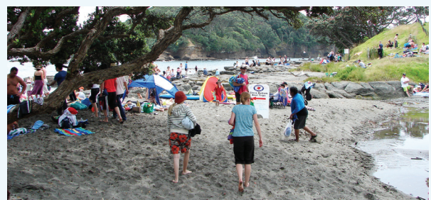
A busy day at Cape Rodney-Okakari Point Marine Reserve, near Leigh.

Visitors often become advocates for marine reserves and marine conservation. The review, however, highlighted the need to investigate the effects of tourism on popular marine reserves, to see if delicate structures are being damaged and if diving and snorkelling are changing fish behaviour.