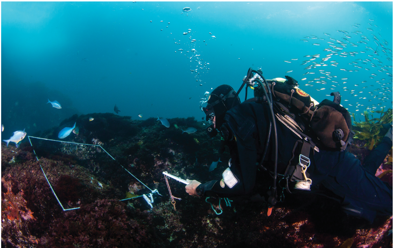
A diver measures the number of shellfish and the seaweed coverage in a 1 metre square sampling area.