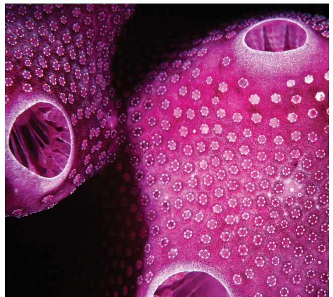
Unidentified colonial ascidian, or sea squirt, Poor Knights Islands Marine Reserve.

www.doc.govt.nz/Documents/science-and-technical/drds340entire.pdf (3222K)